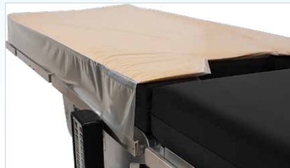
Fitted Sheet style--torso with cut out