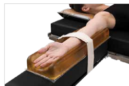
Shown with Stabilizer Strap