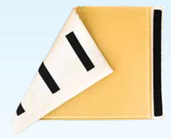
Hook and loop attachment

This pad helps to protect the patient's ulnar nerve and full forearm from damage due to pressure or shear. Designed to be wrapped around the arm and secured with the attached hook & loop.