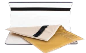
Hook and loop attachment