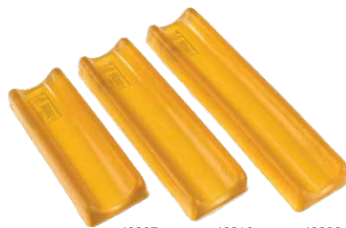
40307 Small 40310 Medium 40306 Large