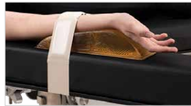
Shown with Stabilizer Strap

40321 11 L x 3 1/2 W x 2 1/4 H" 27.94 x 8.89 x 5.7 cm