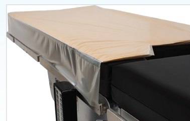
Fitted Sheet style--torso with cut out