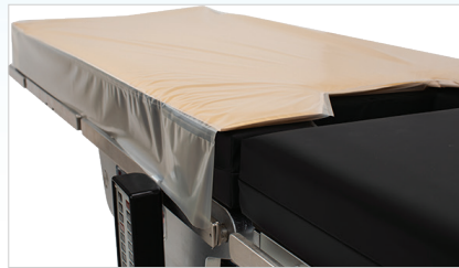
Fitted Sheet style--torso with cut out